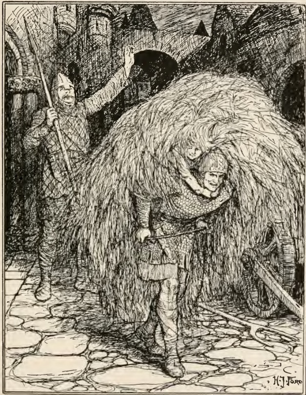
THE TRUSS OF HAY

beating high, Osmond reached the stable, and, choosing a lean black horse, he put on it both saddle and bridle, and led it out by a side door, which opened out on a dark muddy